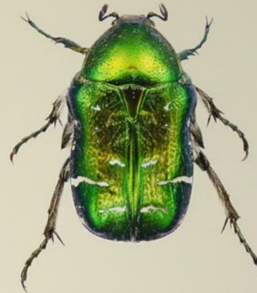
HÄRGULLBASSE / Cetonia aurata