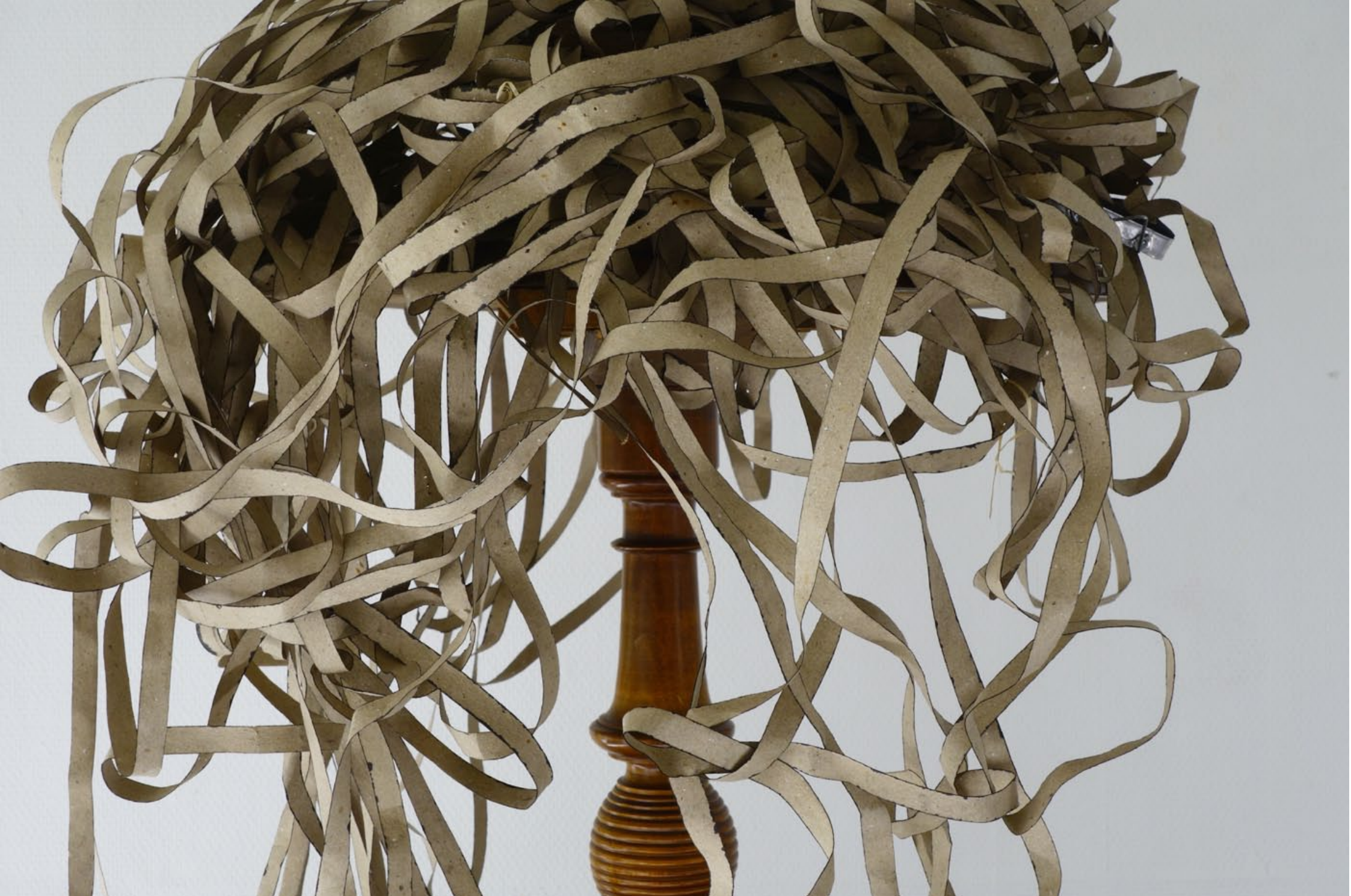
Laila Kongevold / Synchronicity – "I can't remember things before they happen"