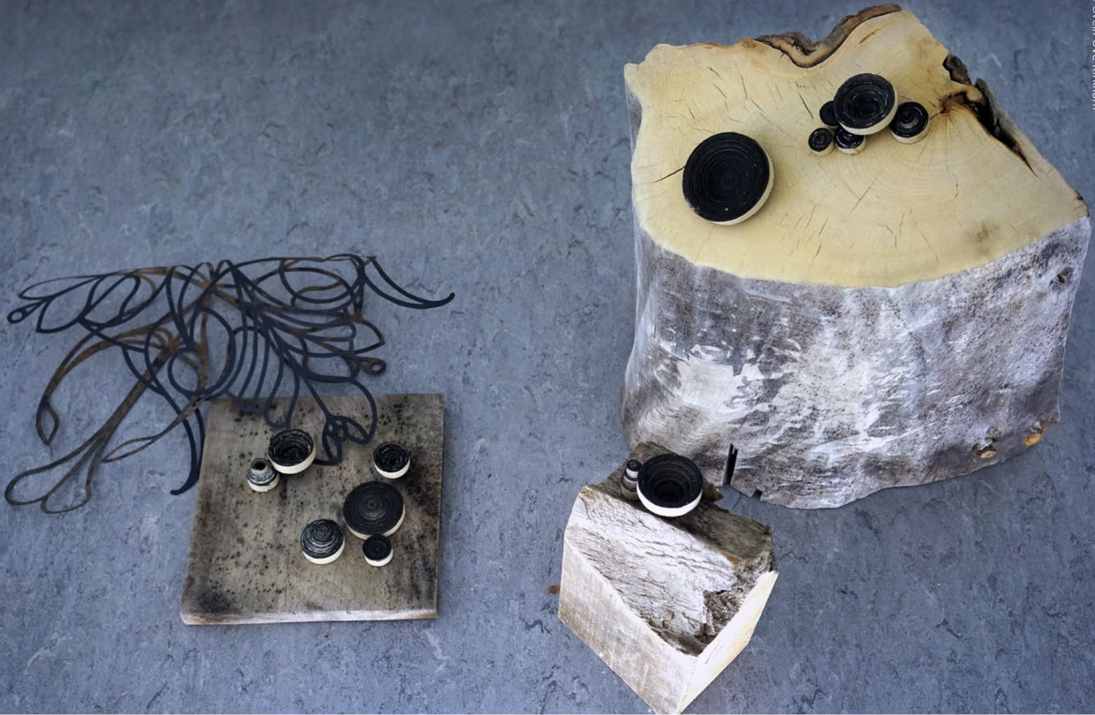
Laila Kongevold / Synchronicity – "I can't remember things before they happen"